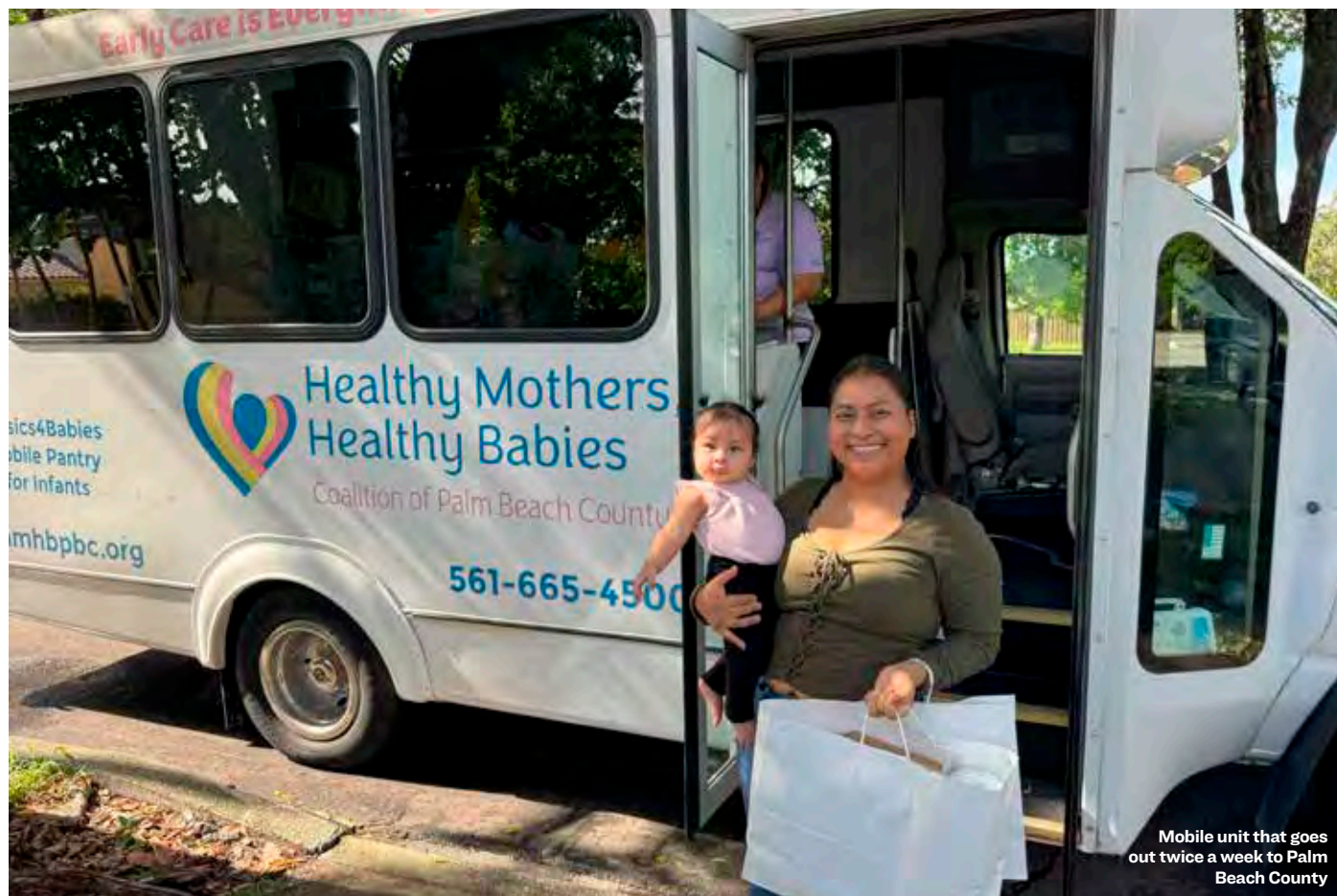
Mobile unit that goes out twice a week to Palm Beach County